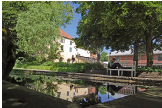
University of applied Sciences Weihenstephan-Triesdorf, Freising

Within the deadline for application 72 students from 31 countries have applied for the summer school. The number of participants is limited to 26. Therefore we will have to select the participants.