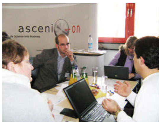
Working session at the Winter Seminar

The Leading group will be presented to the public during the 7 th International Phytotechnology Conference in Parma (26 th – 29 th September 2010).