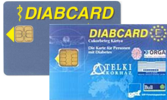
Healthcard Cross border eHealth