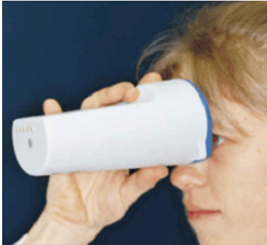
Glaucoma Self Monitoring