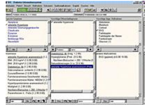
Computer based workstation for diabetes care